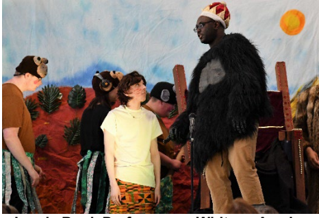
Jungle Book Performance-Whitney Academy

ACES students that benefited from some of the grants awarded during the 2022-23 school year.