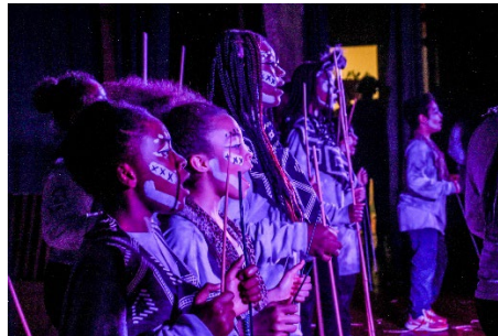
Lion King Jr. Performance