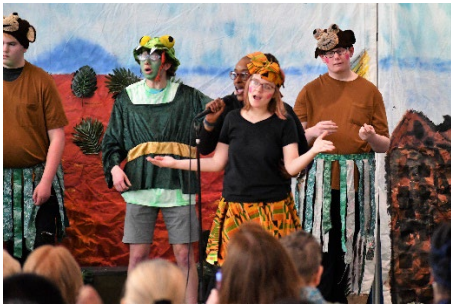
Jungle Book Performance

Your contributions have supported opportunities for ACES students and staff