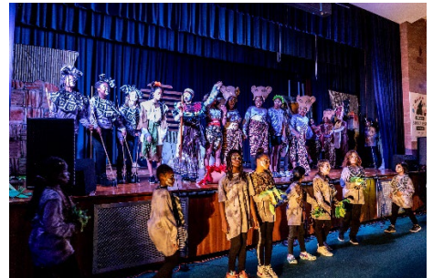
Lion King Jr. Performance

Save the date-20 th annual Gala-March 21, 2024