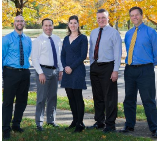
Silver, Petrucelli & Associates