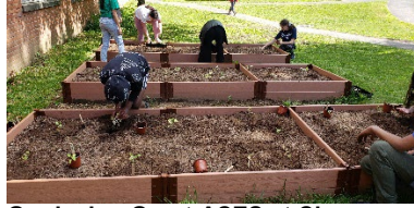
Gardening Grant-ACES at Chase