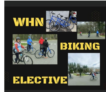
Bicycle Grant-Whitney High School North